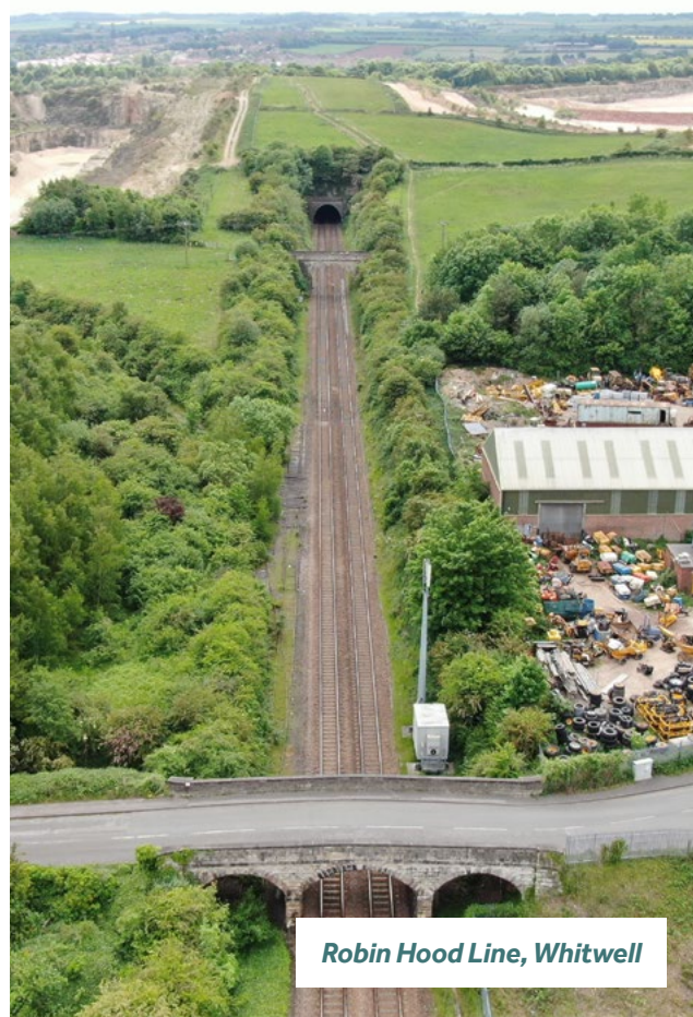
Robin Hood Line, Whitwell

The CRP is supported by Bolsover District Council, Whitwell Parish Council, Langwith Parish Council, Shirebrook Town Council, Community Safety Partnership, Derbyshire County Council, Ashfield District Council, Mansfield District Council, Nottinghamshire County Council, and Community Rail Network, Department for Transport, East Midlands Railway and Cross Country Trains.